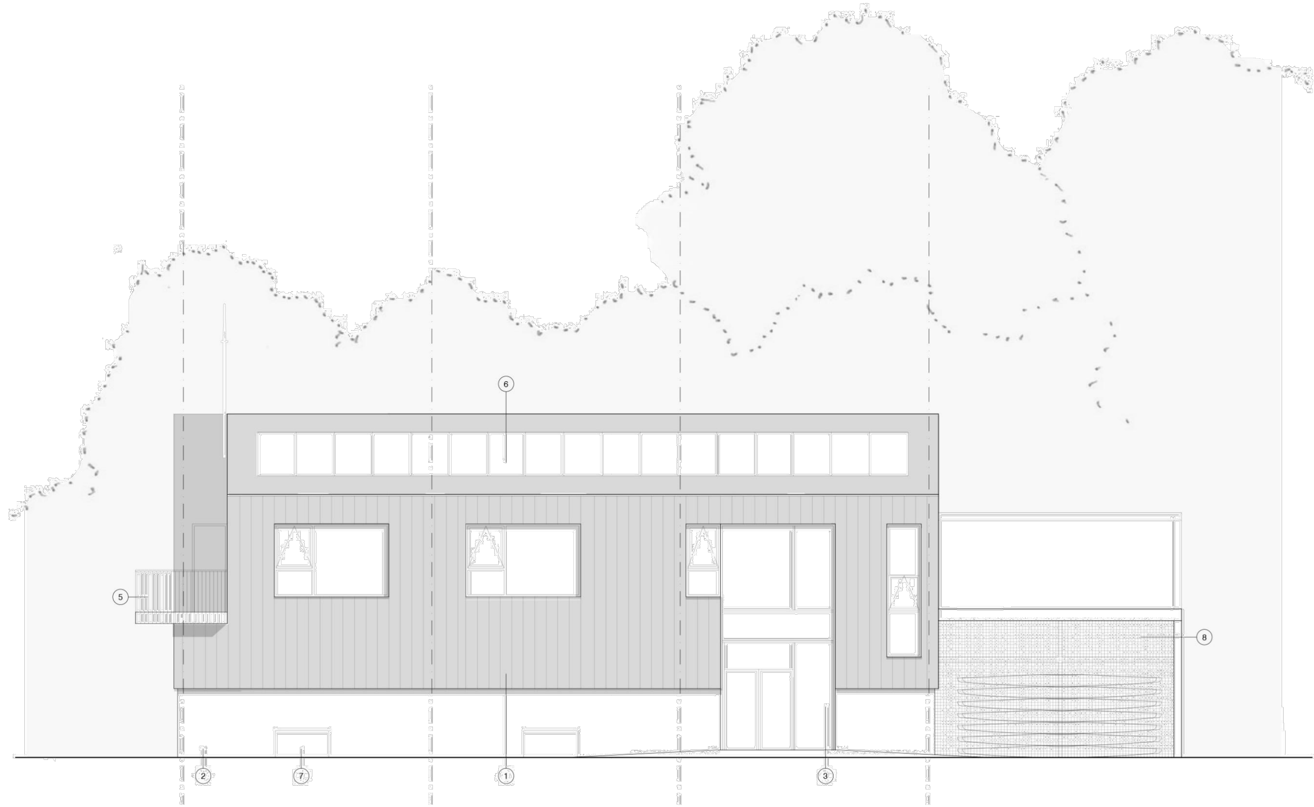
2 South elevation 1:100 0 5m