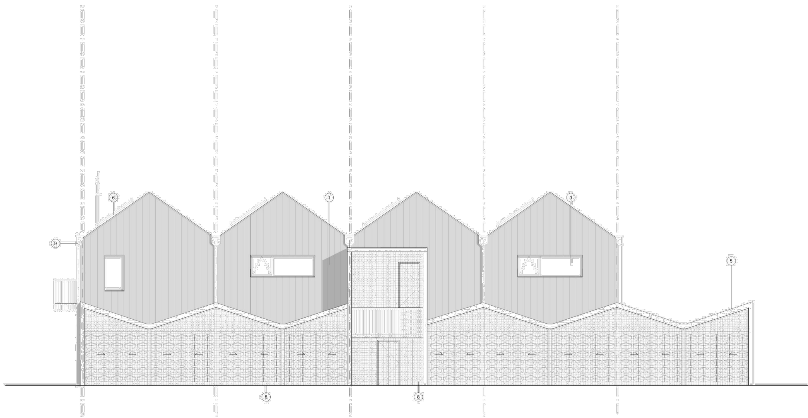
3 East elevation from car park 1:100 0 5m