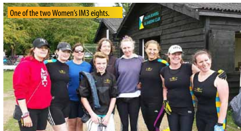
One of the two Women's IM3 eights.