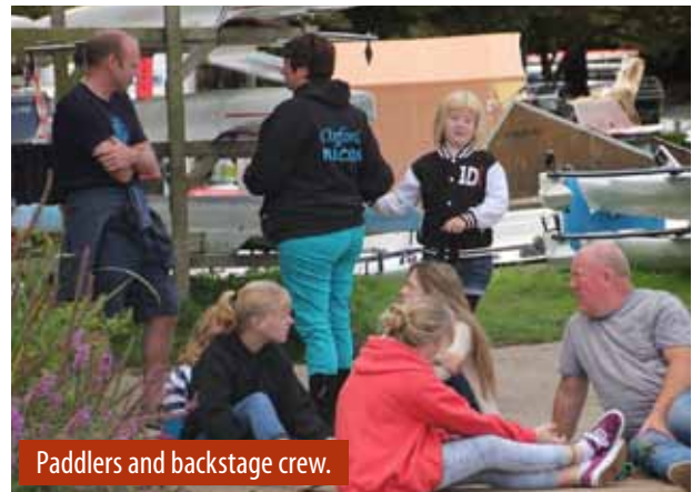
Paddlers and backstage crew.