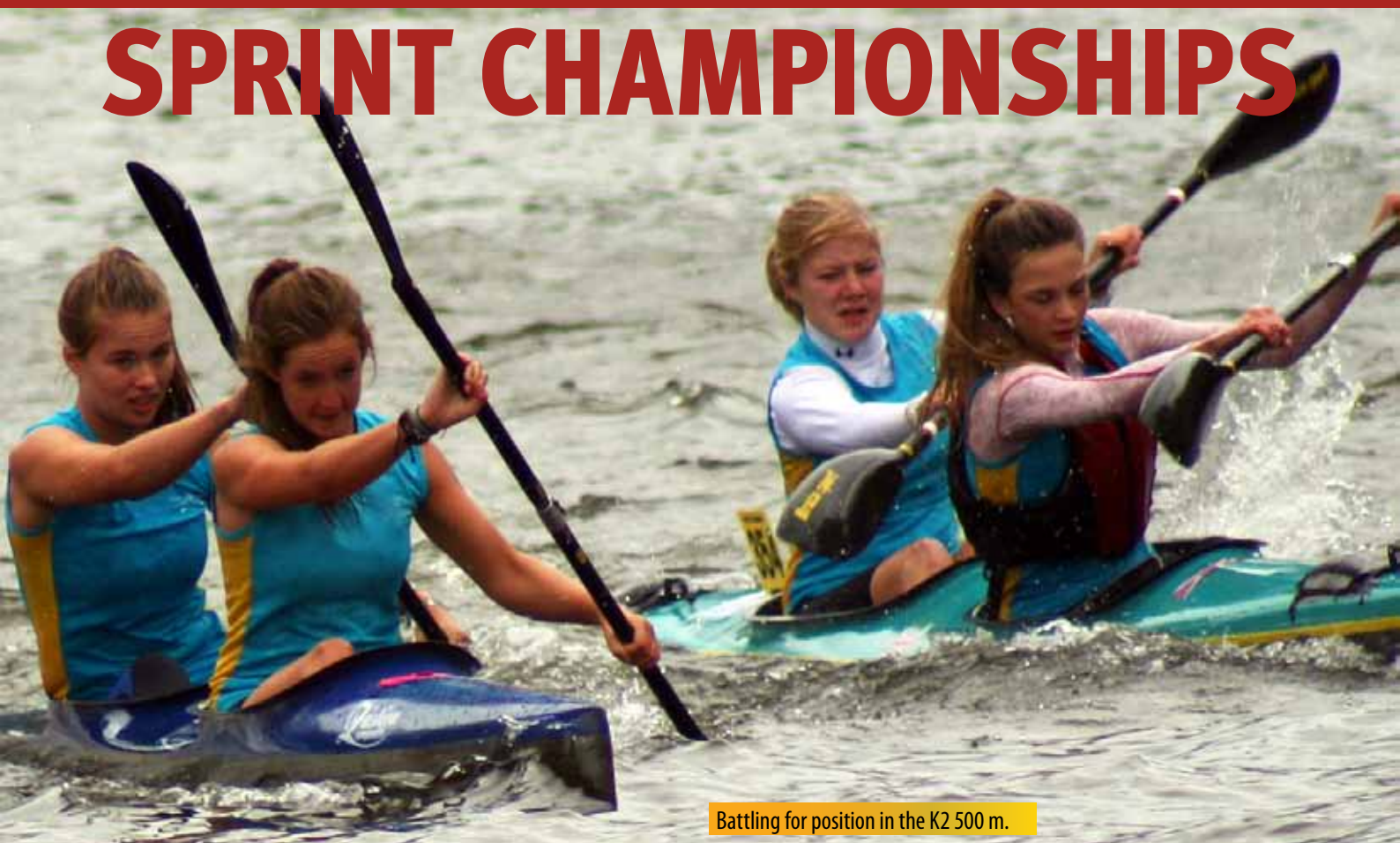
Battling for position in the K2 500 m.

THE JUNIOR PADDLERS headed to Nottingham for the final sprint regatta of the year, the junior national championships. Amazingly, the weather decided to treat us with sunshine and the calmest conditions seen in a very long time. Falcon paddlers won a total of 8 medals, and there were some other very impressive performances, too.