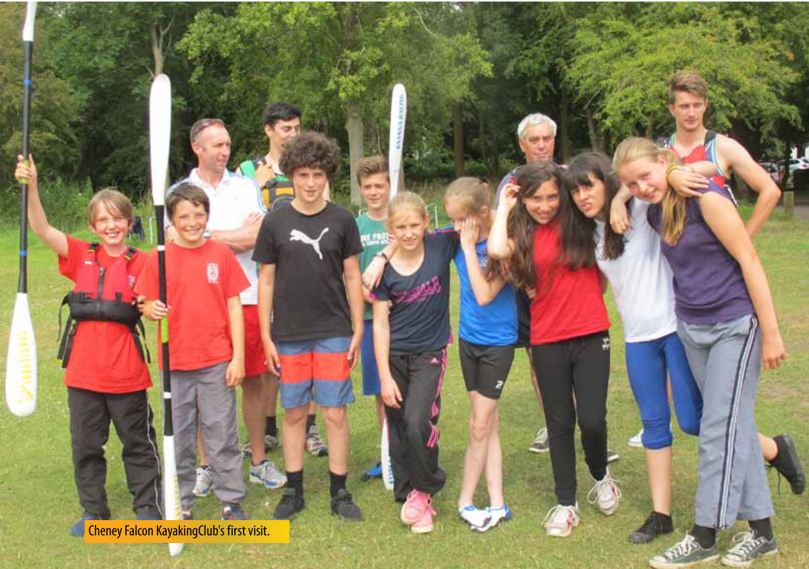
Cheney Falcon Kayaking Club's first visit.